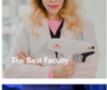
The Best Faculty