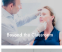
Beyond the Classroom